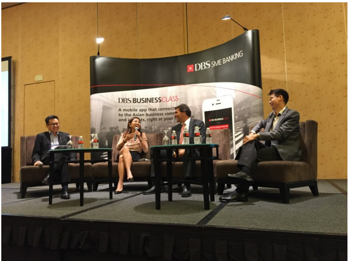
Tim Draper talks on a startup panel in Singapore.

During his talk on spotting and investing in the world's most disruptive tech companies, Draper called Singapore's government 'the best run' in the world